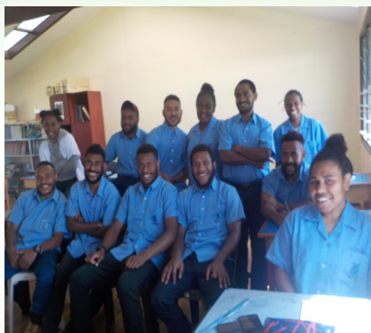
Grade 12 students enjoy learning in RM4 LL Class.