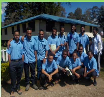
Grade 12 students in front of the IT Building

Teachers have started with mocks and trials beginning of term 2 this year. This is to have more practice done with their students for the respective subjects resulting they have well prepared to sit for their national examination this year.