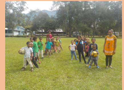
EC & Kinder children playing Tunnel Ball Game on the field with their teachers