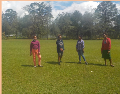
Left: Some grade 7 students playing and enjoying sun bath on the field.