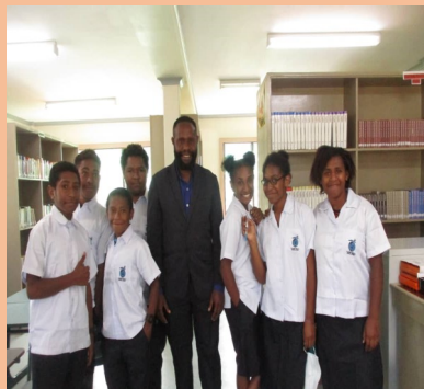
Grade 8 students with their class teacher enjoy reading in the new library setting.

Currently, HLIS has a new library building which contains at least enough books for our students to read. This building has been replaced after burning the old library building in 2018.