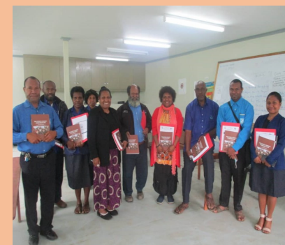
Teachers enjoy the photo session after the In-service.

Even though, it seems challenging at the school level, it is also great to incorporate and integrate into existing topics is a exciting topic to teach. For instance, the cultural marriage can be integrated by poems, cartoons and picture stories.