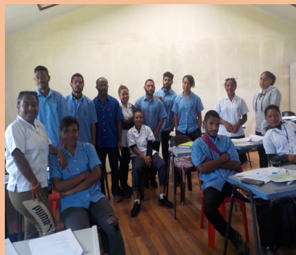
Grade 11 students having chemistry class with their subject teacher.