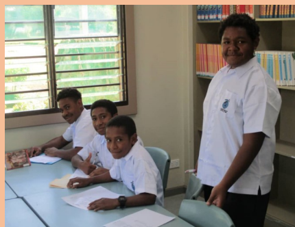
Above and left Grade 8 students enjoying their library class