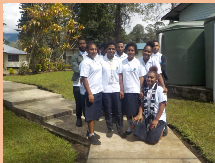
Grade 10 students enjoy sun bathing on the pathway to their classroom.