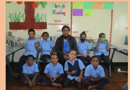
Grade 2 children enjoying photo session in the class with their teacher