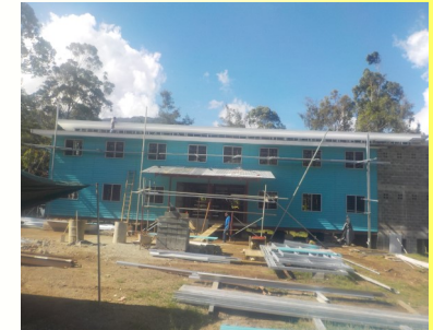
Front view of 42 bedroom New Dormitory Building for the girls.

'Credit' is due to the Enga Provincial Government for facilitating this impact project.