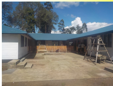
Front view of 9-In-1 Primary Building.

The school's modern and the most ironic State-of-the-Art 9-in-1 Building is near completion. The building is consisted of; 6 classrooms which are spacious, 1 office, 1 ICT & Library office and the toilet block with shower for students and teachers.