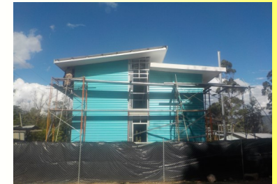
Side view of the New Building