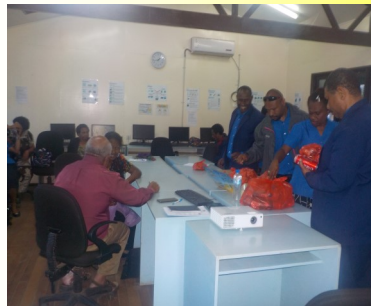
Having Light Refreshment after the Meeting - ICT Lab

The HLIS General Staff Meeting is organised two meetings every term. This is to discuss issues concerning the school operation. It is to find amicable solutions to improve learning and teaching and also to improve teacher professionalism.