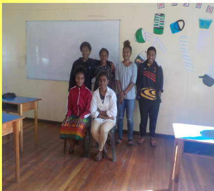
Grade 9 students stood for the photo session after the English Oral Presentation in their classroom.